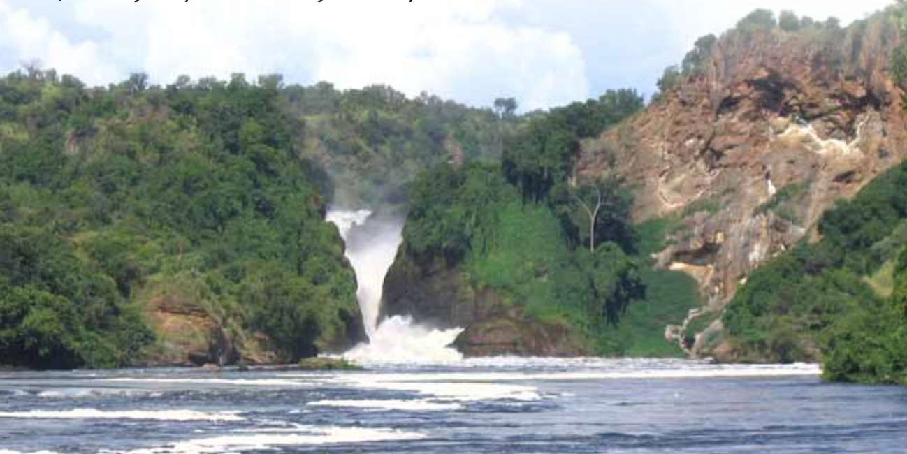
The magnificent Murchison Falls on the R. Nile in Uganda

This paper briefly introduces NBI, demonstrates its role in building Nile cooperation thus far (against a background of low levels of cooperation), highlights the success factors and draws attention to the lessons learned.